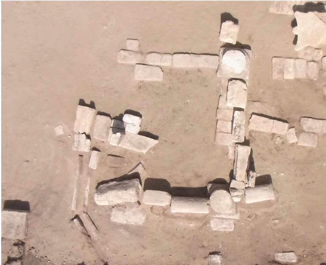
Figure 3. Aerial view of the area where the corners of the columns of the ciborium can be seen.