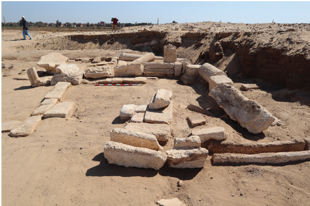
Figure 4. Side view of the baptistery showing the column bases and the drainage system for emptying the baptismal font or pool.