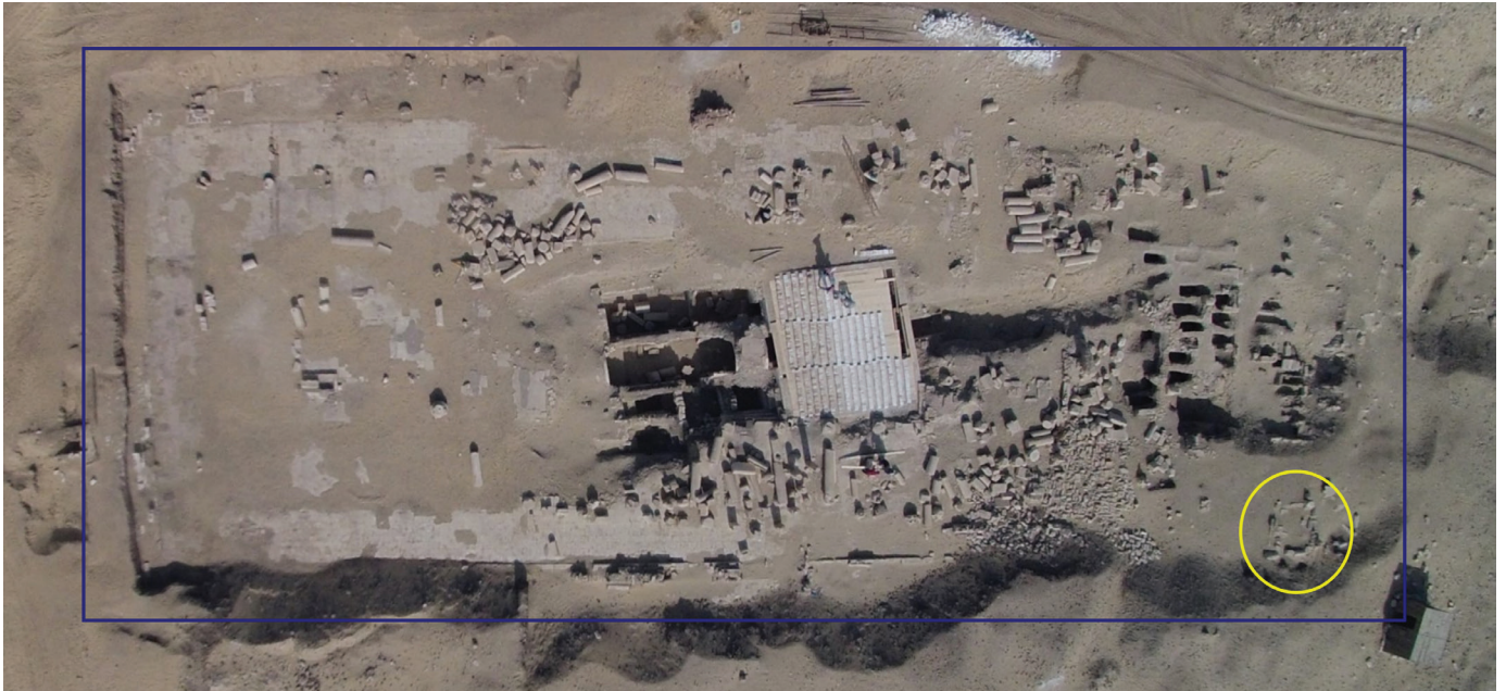
Figure 2. Aerial photo of the basilica in 2016 with the location in yellow where the baptistery and baptismal font were found.

The different architectural elements found in the sector; bases, columns, capitals, plinths and lintels tell us of a space dedicated to a saint of whom we had no evidence until it was possible to identify him through the inscriptions in the crypt and their subsequent confirmation in papyri, so that the studies carried out on the archaeological, papyrological and epigraphic documentation found in recent years 13 seem to support the identification of this building with the basilica of St. Philoxenus.