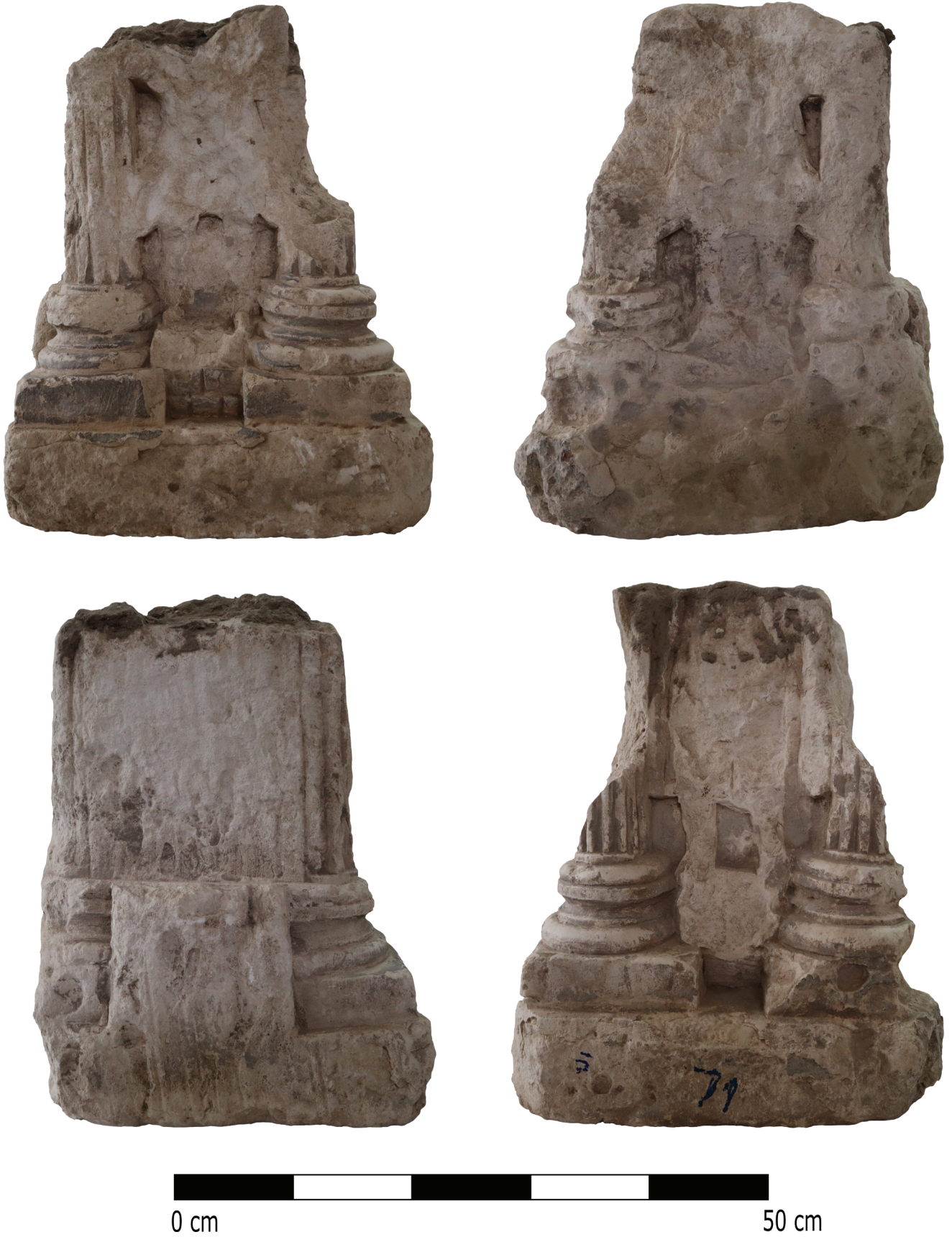
Figure 5. View of the 4 faces of the fuste of the baptismal font.