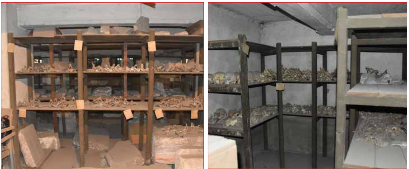
Figure2. Pre-curation of Skulls and Hips at room 3 (a) Hip bones placed on the central south shelves (b) Skulls placed on the south 2 shelves. (Photos by A. Gabr).

Skulls, pelvises, and mandibles were grouped separately, while some bones were labeled with individual or cemetery numbers to facilitate the reconstruction of complete skeletons. A few complete skeletons were identified and segregated. While some collections were well-preserved and stored in wooden boxes, others were housed in deteriorating containers filled with various materials, including sawdust, straw, sugarcane, and cotton. Notably, some skeletal materials were wrapped in antique newspapers, while others were wrapped in plain brown paper (Fig. 3). Despite these challenges, the majority of the remains were successfully salvaged, totaling approximately 9,000 skeletal and mummified remains from both rooms. As the ongoing survey progresses, it is anticipated that several thousand additional remains will be incorporated into this initial assemblage.