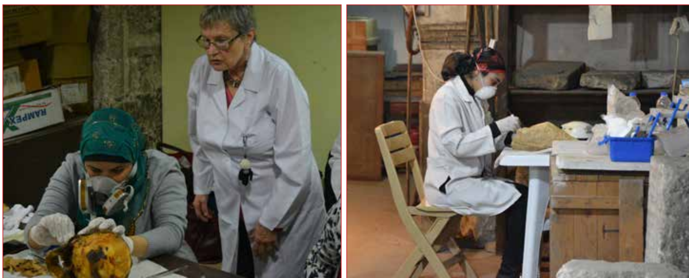
Figure 6. Conservation steps for both human remains and basket coffins

A primary objective of the project was the implementation of effective storage protocols for the skeletal remains. To this end, bones were meticulously wrapped in acid-free tissue paper and bubble wrap before being placed in custom-designed plastic containers. Larger containers, measuring 44x39 cm, were utilized for complete skeletons and skulls, while smaller containers were reserved for isolated skulls and pelvises. Internal dividers were employed to separate individual remains or skeletal elements. Mummified remains were similarly protected, using cardboard covered in acid-free tissue paper. For complete mummies, specialized wooden boxes were constructed to accommodate their specific dimensions. All containers were clearly labeled and organized on numbered shelves, in accordance with the Egyptian Museum's established storage practices (see Fig. 7).