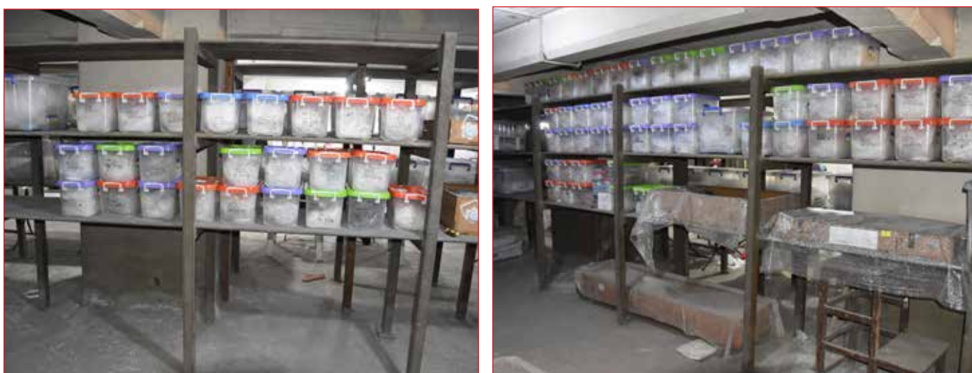
Figure 7. Storage system in room 3 central north shelves.

A primary objective of the project was the implementation of effective storage protocols for the skeletal remains. To this end, bones were meticulously wrapped in acid-free tissue paper and bubble wrap before being placed in custom-designed plastic containers. Larger containers, measuring 44x39 cm, were utilized for complete skeletons and skulls, while smaller containers were reserved for isolated skulls and pelvises. Internal dividers were employed to separate individual remains or skeletal elements. Mummified remains were similarly protected, using cardboard covered in acid-free tissue paper. For complete mummies, specialized wooden boxes were constructed to accommodate their specific dimensions. All containers were clearly labeled and organized on numbered shelves, in accordance with the Egyptian Museum's established storage practices (see Fig. 7).