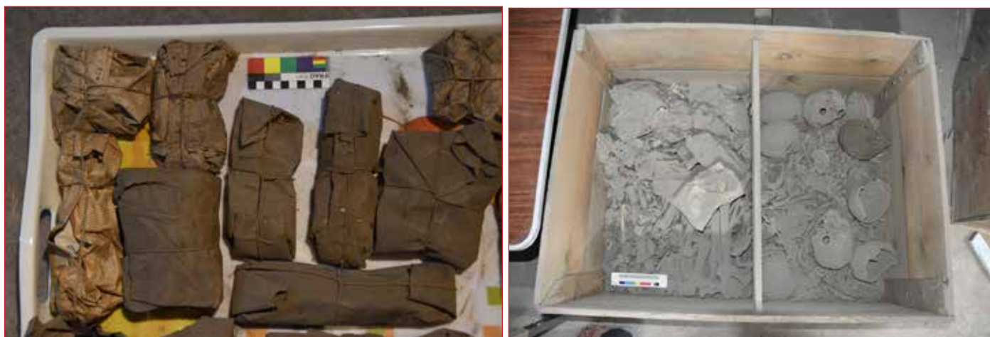
Figure3. Historical Context of the Collections (a) Skeletal remains from Emery's Nubian excavations (1929-1931), wrapped in plain brown paper and newspapers. (b) Skeletal materials from Petrie's Deshasha excavations (1897).