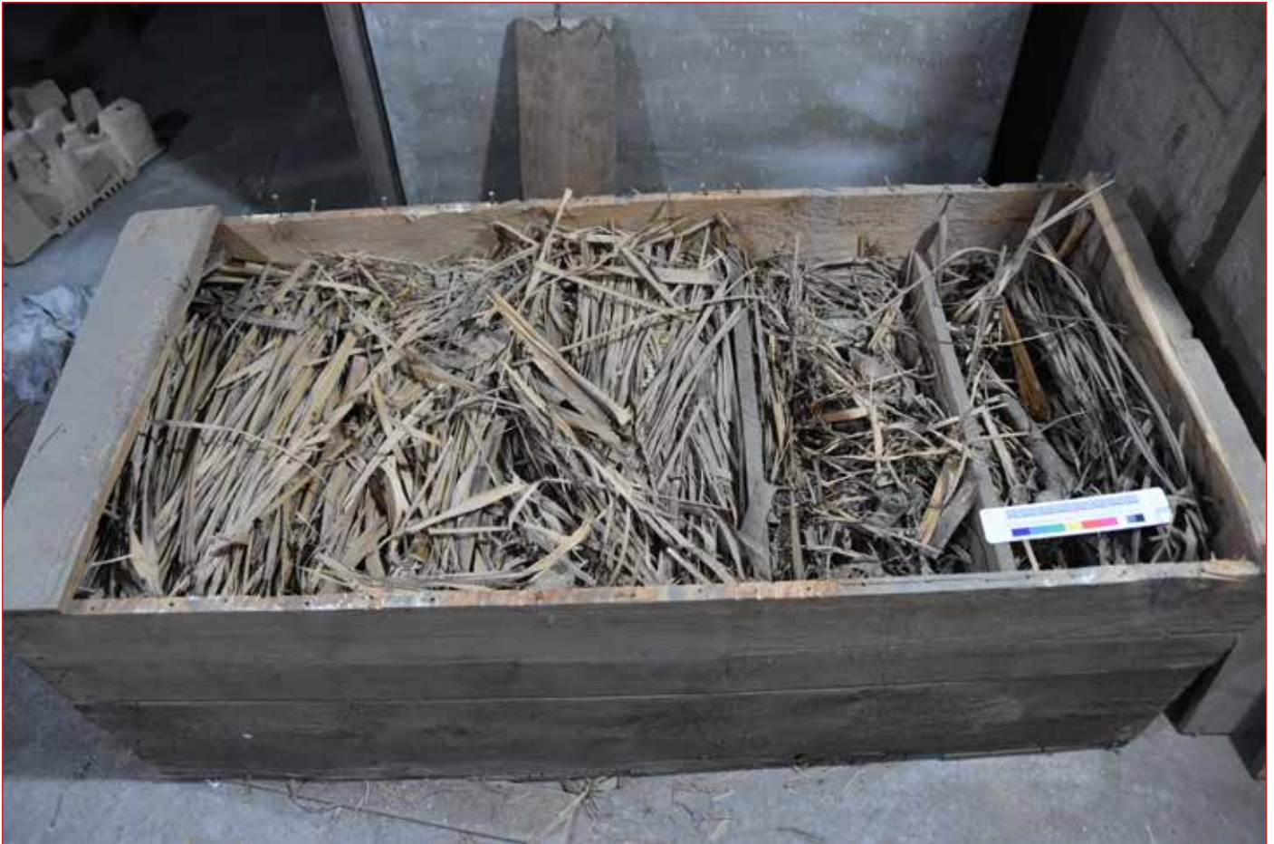
Figure 11. Box TR 9/11/14/2, which contained human remains recovered from Petrie's excavations (1898-1899) at the sites of Hu and Abadiya.