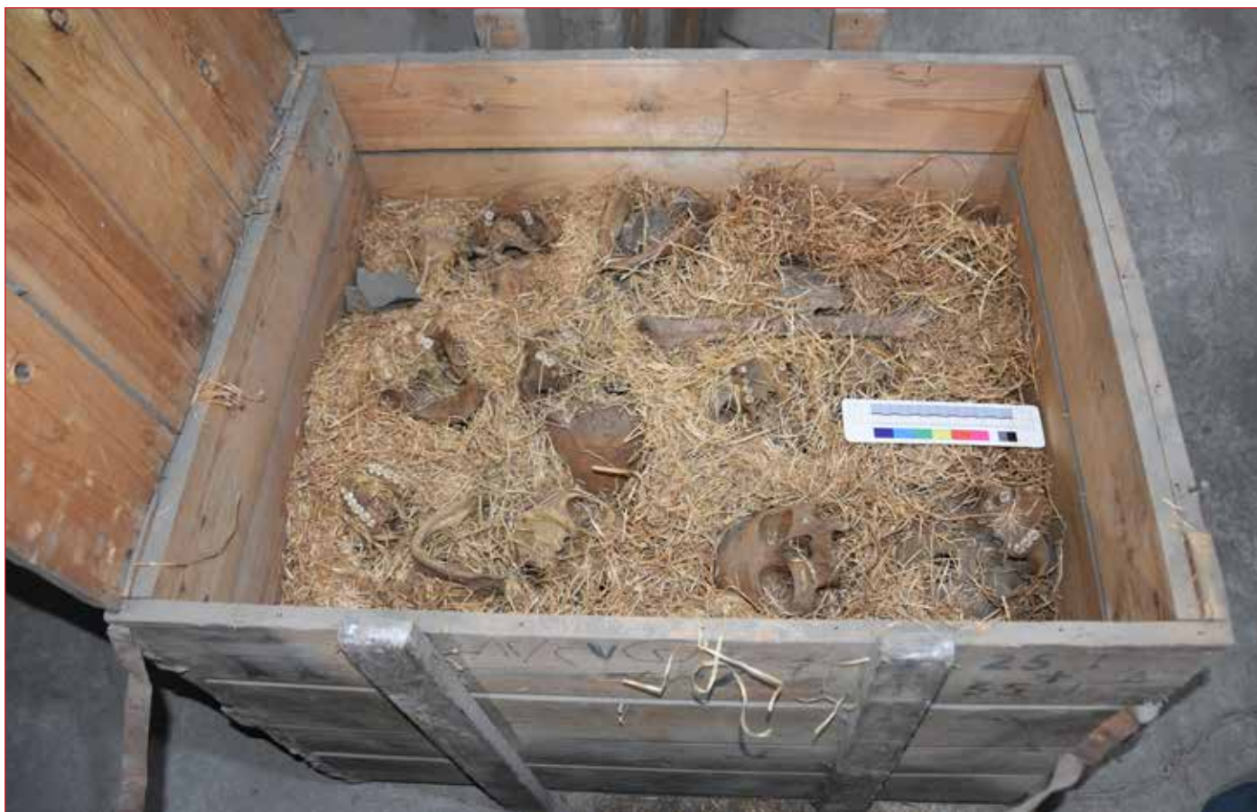
Figure 13. Edfou Excavation of 1939: Box TR 25/1/55/1A.