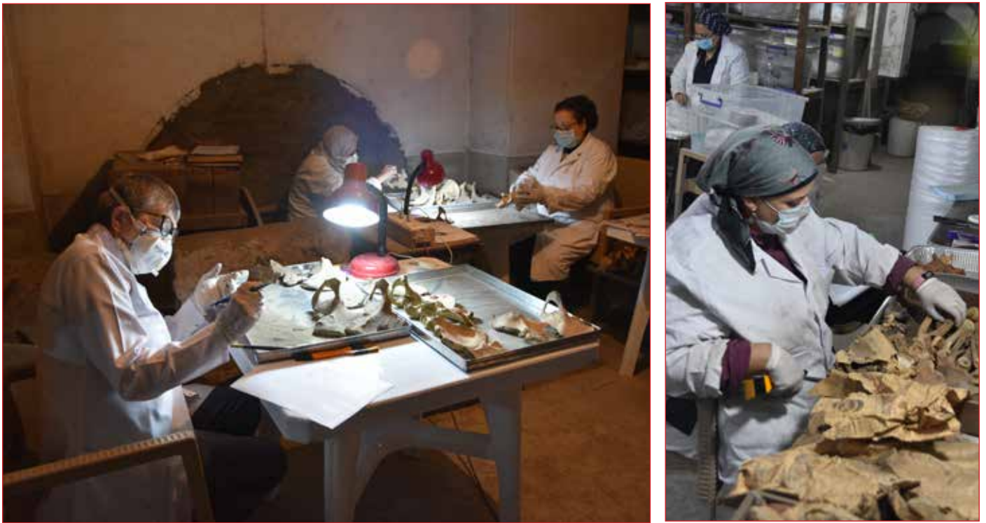
Figure 4. Cleaning process for both newspapers and human remains