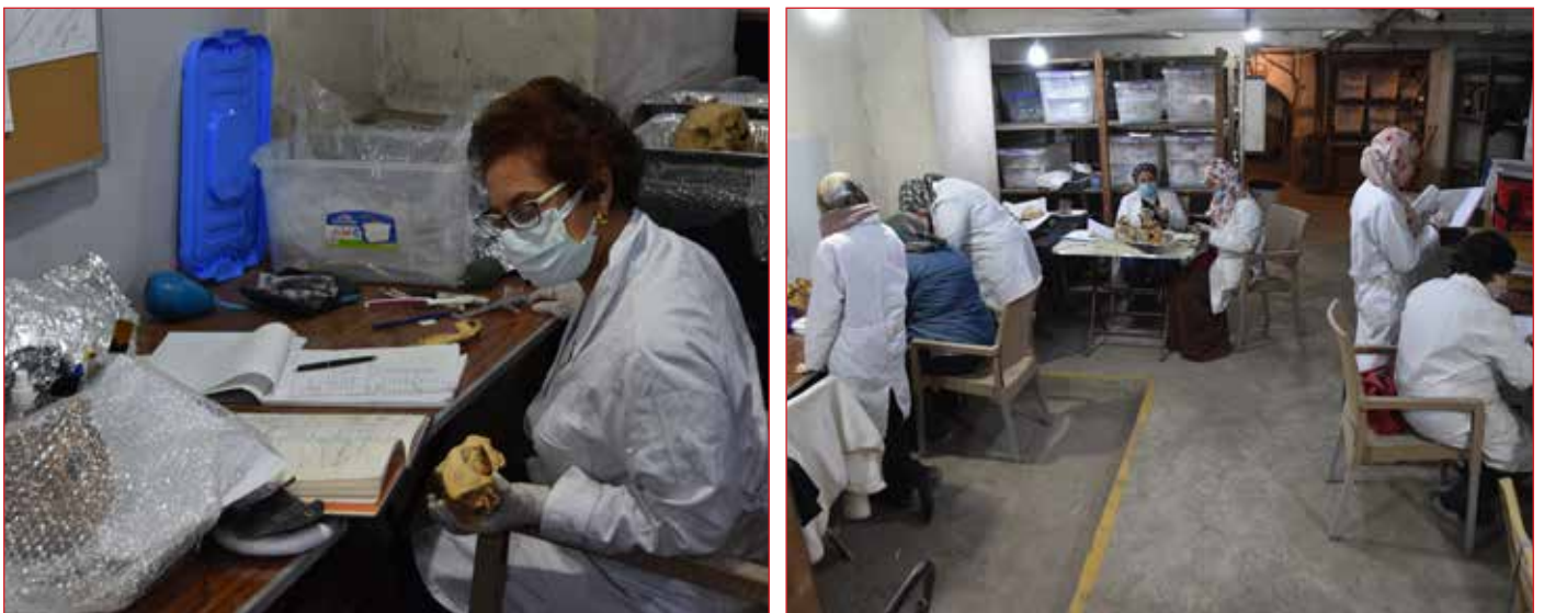
Figure 5. Documentation and analysis at room 3